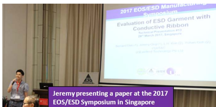
Jeremy presenting a paper at the 2017 EOS/ESD Symposium in Singapore

Evaluation of ESD garment with Conductive Ribbon [Enhance the current market designed garment to ensure there is no failure in ESD requirement after years of repeated washing before the fabric gets worn out.]